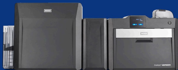
Dual-sided printer/encoder with optional lamination